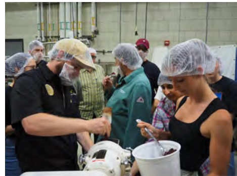
Food Science summer school attendees at a bean-to-bar chocolate making workshop.