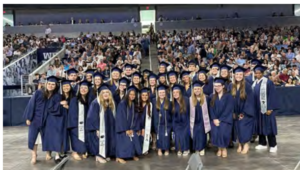
Congratulations Spring Class 2025!