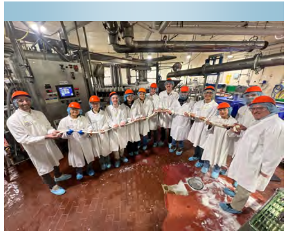
Food Science students tour Lactalis American Group at Buffalo New York facility

Through our continued partnership with Lactalis American Group, our students have been able to receive summer internships, employment opportunities, and a sponsored master's degree in France. The Lactalis Scholarship Program that provides one sophomore per year an opportunity to be awarded $5k for their Sophomore, Junior, and Senior Year.